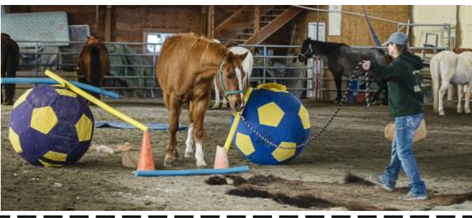
The Youth Horsemanship Clinic on Trail Skills, LNT & Communication was a fun day of learning new skills and concepts. cont. on p.6